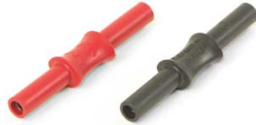
Figure 14: 1 each PAS-853S Test Lead Shunt provided with the instrument.