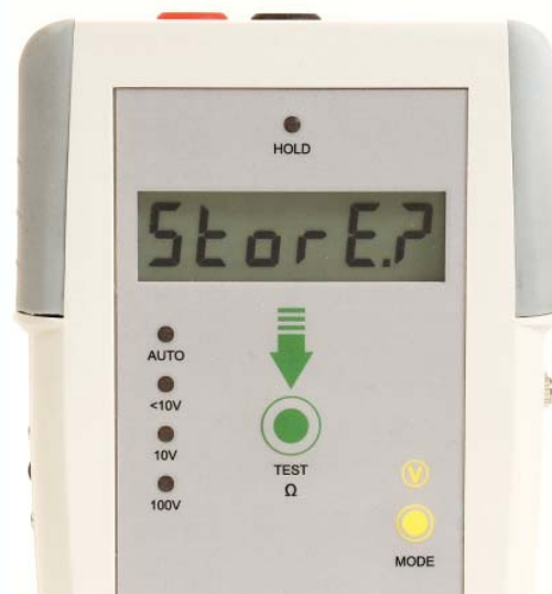
Figure 19: E12 C? and StorE? will display